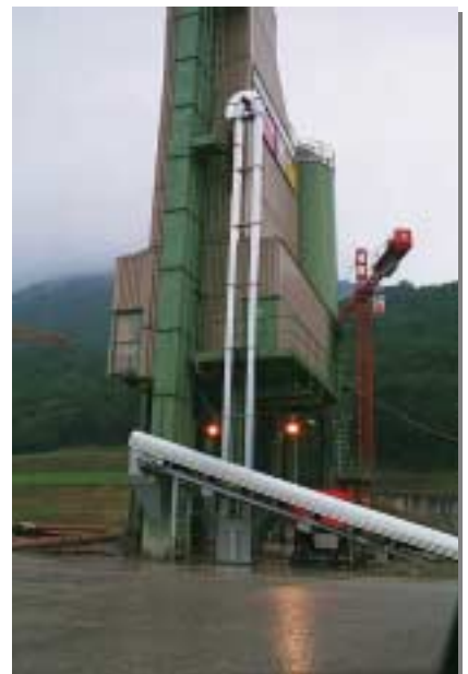
Tunnel Concise, Switzerland

Please contact Incite AB for further information and references!